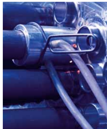
Internal bore welding.

In the ethylene production process the TLE is one of the dominant solutions for quickly cooling of gas after cracking. Alfa Laval Olmi's patented design concept is an innovative solution that ensures reliable operation and trouble-free performance. Alfa Laval Olmi TLEs solve the problems and answer to the weaknesses of traditional solutions, such as erosion and corrosion, structural damage through heat stressed welds, and uneven coolant flow.