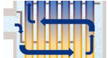
Even flow of coolants where most needed.