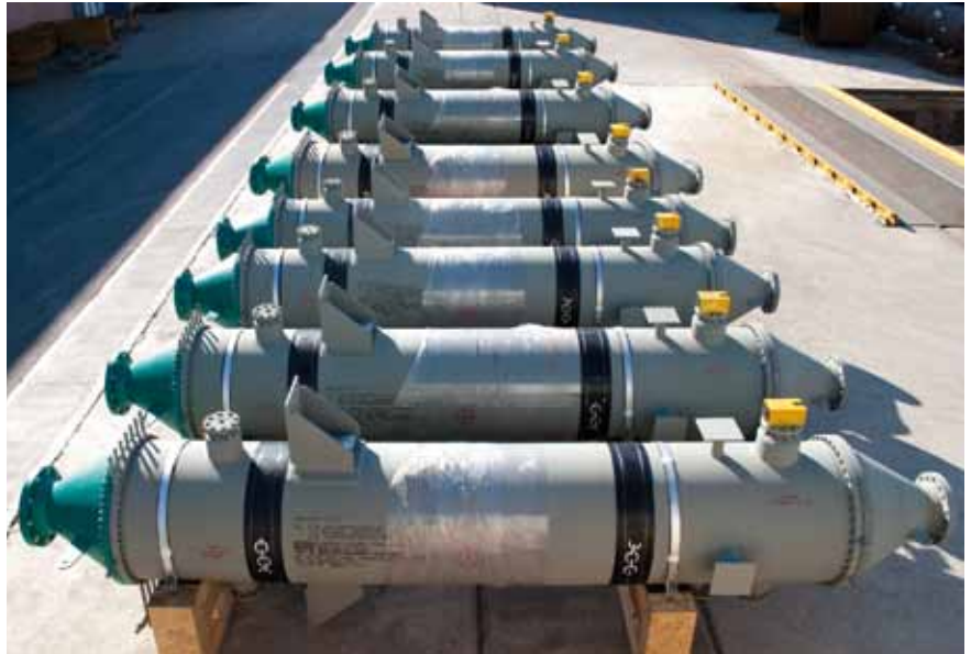
Alfa Laval Olmi solutions have been tried, tested and praised on almost 300 sites across the world.

Together these Alfa Laval Olmi TLE innovations overcome the structural problems of fast quenching of cracked gas. This ensures you a maximum lifetime for the TLE with continuous reliable operation year after year.