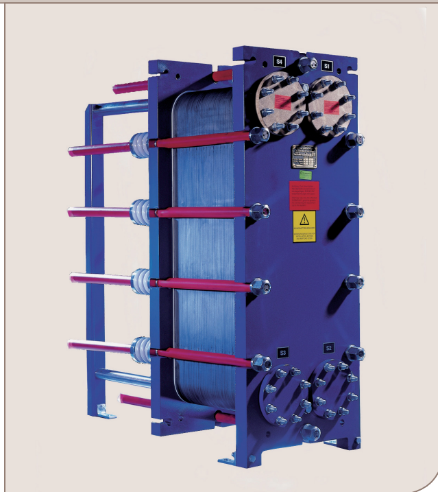
Plate types: S1, M10-G, S10, S15.

Max flow rate of 250 m 3 /h, depending on media, permitted pressure drop and temperature program.