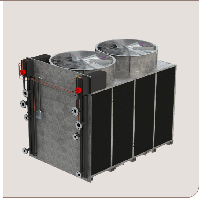
DCH Gen-set radiator unit

3-Phase 400V-50Hz squirrel cage induction motors (IEC) are used, on demand 460V-60Hz or other power supply. Protection Class IP55, temperature class F or H, depending to the working conditions. On demand greasers can be included. Each electric fan motor is wired to a terminal box or a safety switch close to the fan cowl.